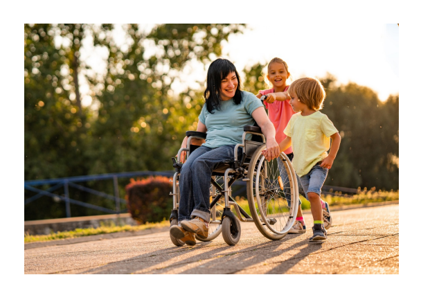
Building an Estate Plan for Adult Children with Disabilities