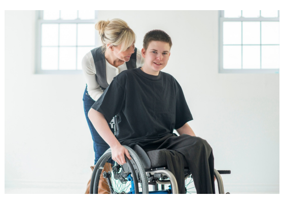
Transition Plans Support Adolescents with Disabilities