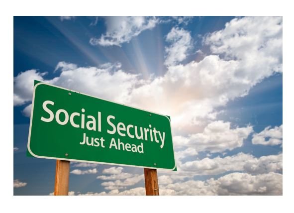
Your Social Security Benefits for 2025: Cost of Living Adjustment