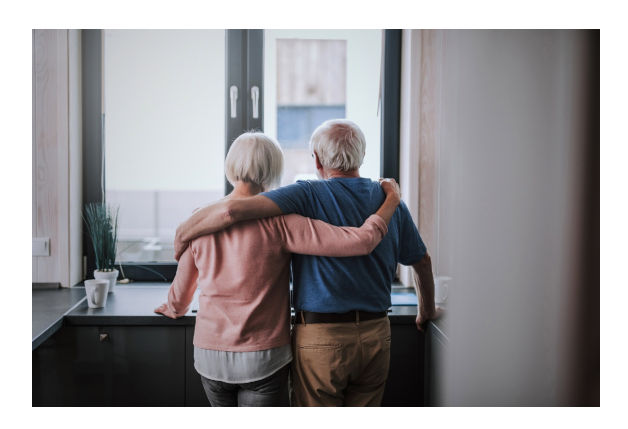
Why Hire an Elder Law Attorney?