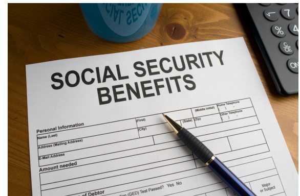
What Will Your 2024 Social Security Benefits Look Like?