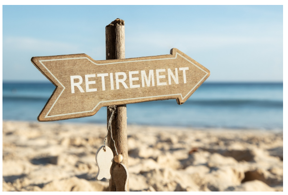
10 Ways to Maximize Your Social Security Retirement Benefits