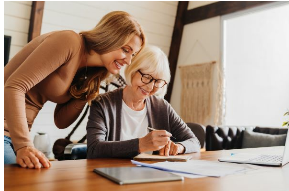
A Brief Overview of Trust Types