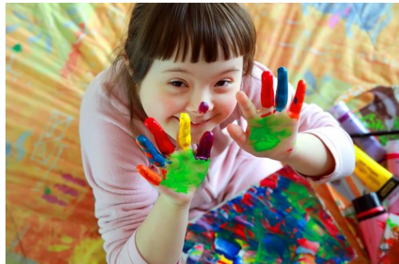
What You Need to Know About Special Needs Trusts