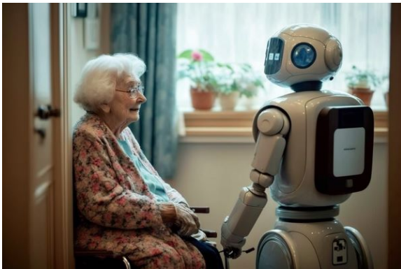
An Analysis of Artificial Intelligence and the Aging Population