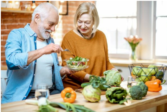
Nutrition Tips for Seniors